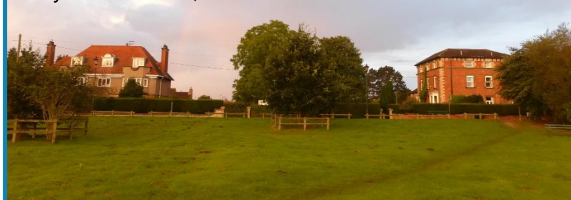
Holy Rood House, Centre for Health and Pastoral Care

Holy Rood House, Centre for Health and Pastoral Care , is a community of hospitality working on the margins of society. Our continual therapeutic and theological exploration and reflection, underpins the work of the Charity.